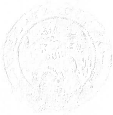
Fiscal Officer of the Village of West Salem Wayne County, Ohio

Witness my signature this 20 TH day of April, 2022 .